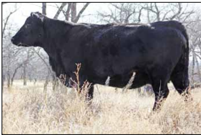
Lisco Ethelda 816 ~ Dam of Lot 11