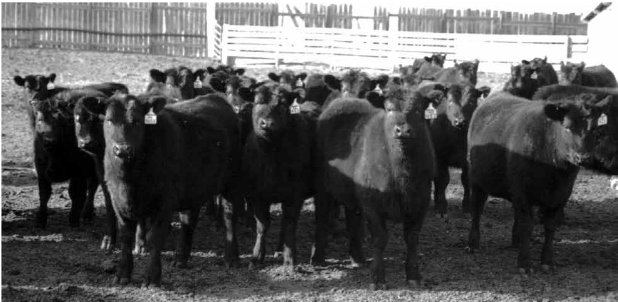
Lisco Angus commercial heifer calves.