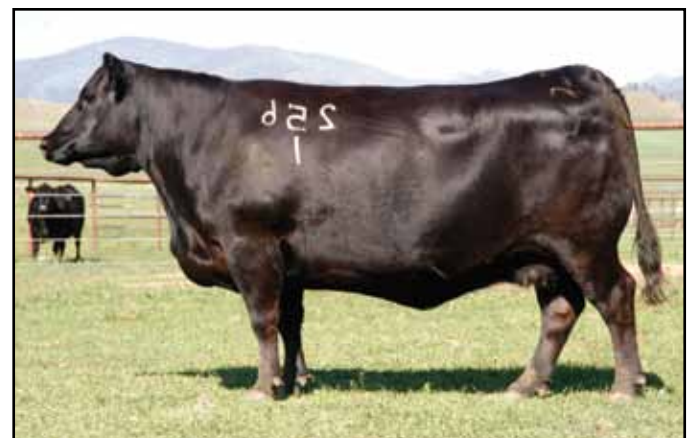
Sitz Pride 2561 ~ Dam of Sitz 4 Aces 4551

Calving Ease: Dam's Production: 8@103 A deep ribbed, heavy muscled 4 Aces. Our first 4 Aces daughters are calving this year and look to be the right kind for our environment. 3/4 brother to Lot 5.