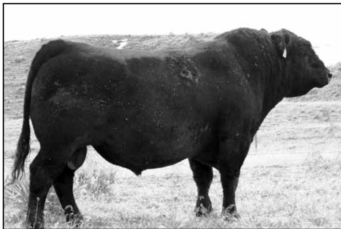
Redland Emblazon 2134 ~ Foundation sire

Calving Ease: ◆◆◆ Dam's Production: 9@101 An easy calving son of our herd sire 0263 Chisum.