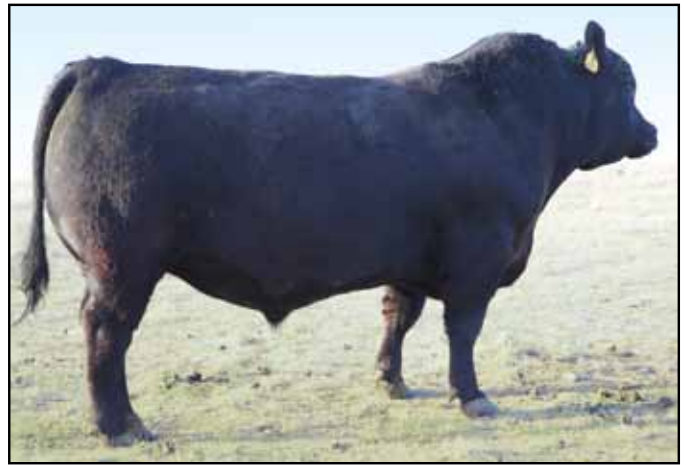
Sitz 4 Aces 4551 ~ Sire of Lots 101-104

Calving Ease: ♦♦ Dam's Production: 5@102 PAP Score: 50+ A sleep-at-night heifer bull that is stout and moderate framed.